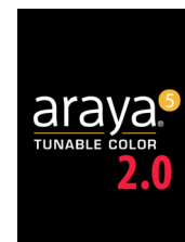
araya 5 Tunable Color 2.0 iOS App