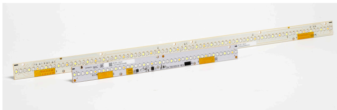
araya 5 Tunable Color Linear LED Arrays

2016 IES PROGRESS REPORT SELECTION • 2016 LFI INNOVATION AWARDS CATEGORY WINNER • 2016 LUX AWARDS HIGHLY COMMENDED • 2016 EDISON REPORT TOP TEN MUST SEE LIST